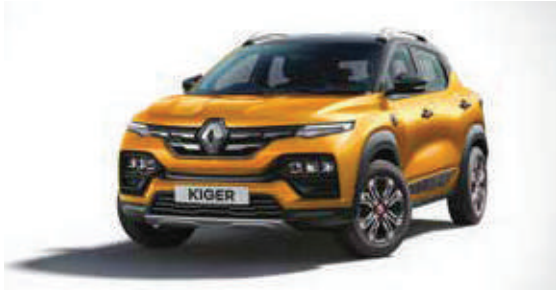
NEW METAL MUSTARD