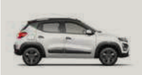
ICE COOL WHITE - DUAL TONE