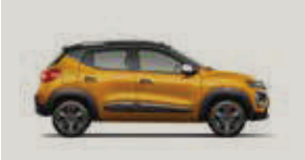
METAL MUSTARD - DUAL TONE