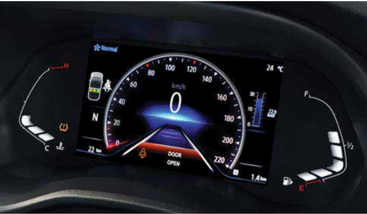
rear seat belt reminder Designed to alert the rear seat passengers to buckle up for a safe drive.