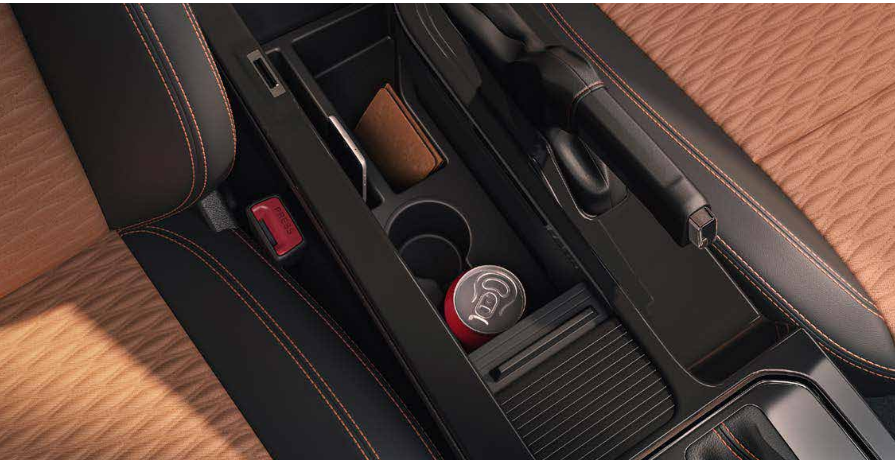
armrest console organiser Keep your travel essentials neatly organised and easily accessible at arm's reach.