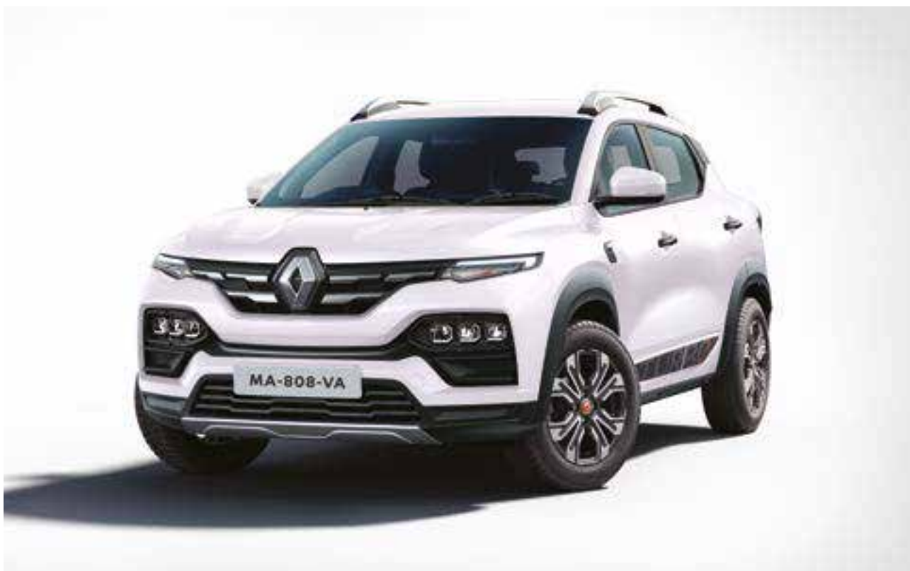
ice cool white