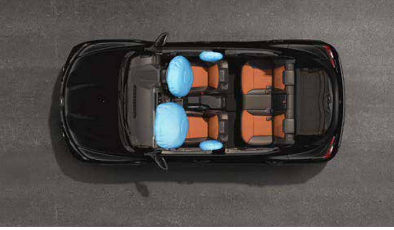
front & side airbag - driver & passenger 1 Four airbags 1 offer increased protection.