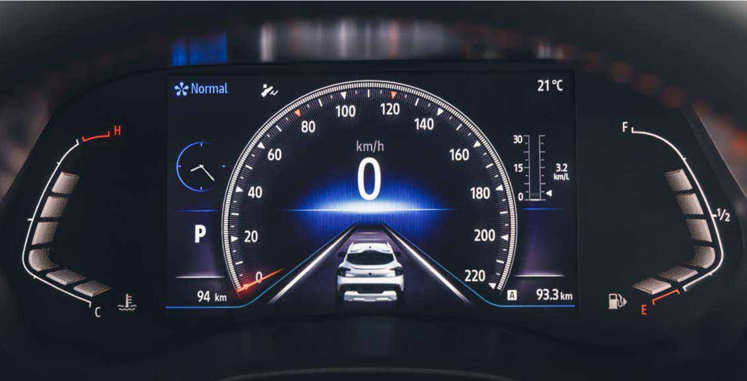
17.78 cm reconfigurable TFT cluster

Take control of your adventures, be it in the city or out on the highway. Cruise in the normal mode, switch to the fuel-efficient, eco mode or enjoy dynamic driving with sport mode.