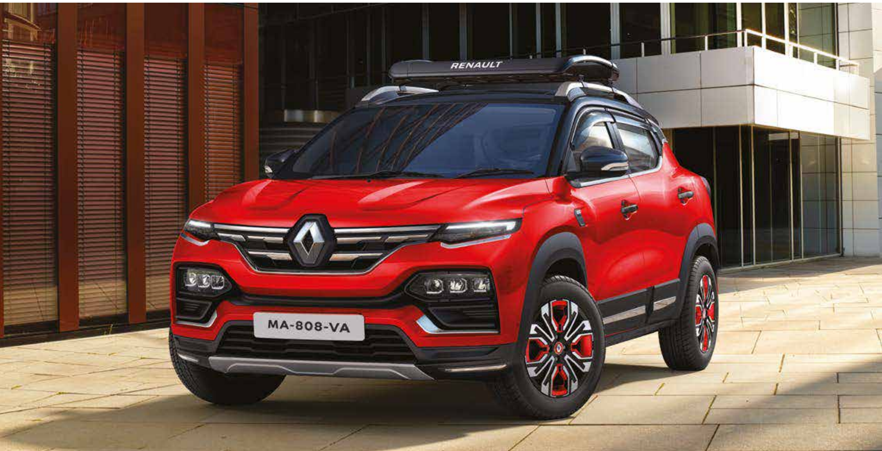
chrome contour parts Leverage the already stunning details of the SUV with a neat highlight of chrome accents.