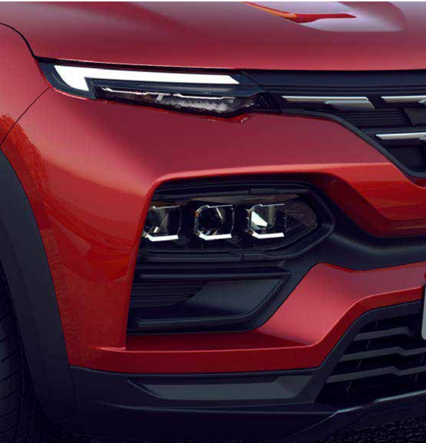
tri-octa LED pure vision headlamps

The finest details, like the chrome front grille, 40.64 cm diamond cut alloy wheels, sporty red calipers, rear spoiler, and LED headlamps with LED DRLs, reflect the SUV's cohesive design philosophy.