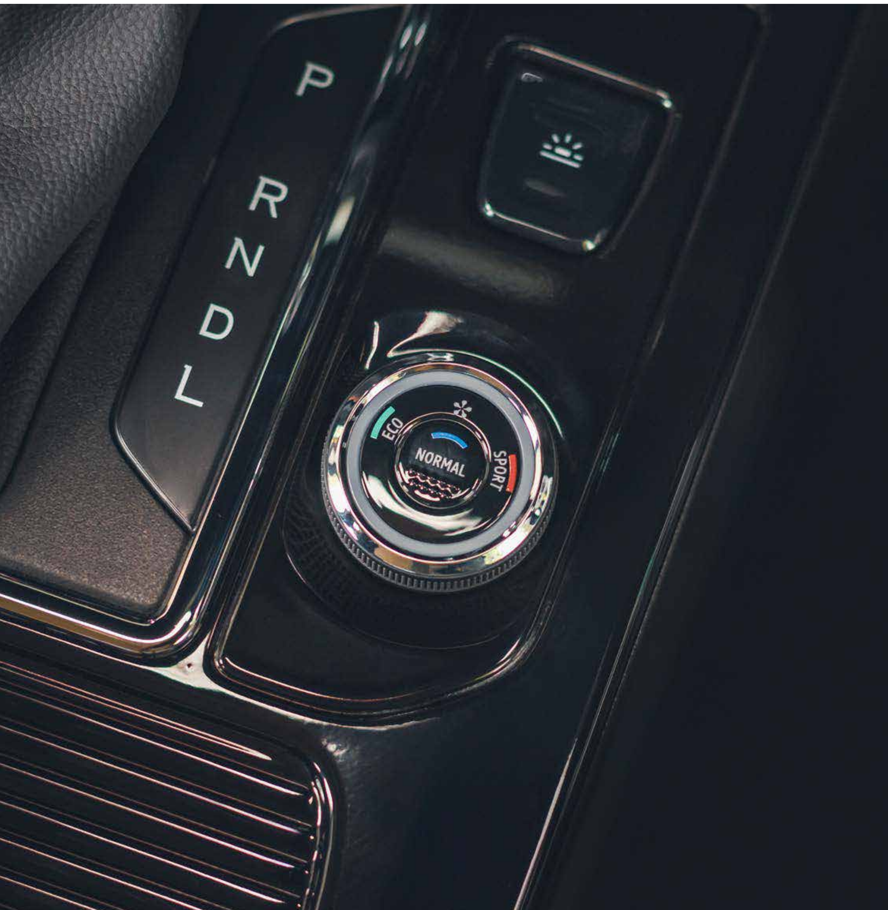
multi-sense drive modes

Experience a host of responsive features designed for a bold SUV. With a turbo-charged engine under the hood and an effortless driving experience enhanced by multi-sense drive modes, Renault Kiger truly combines the best of performance and efficiency.