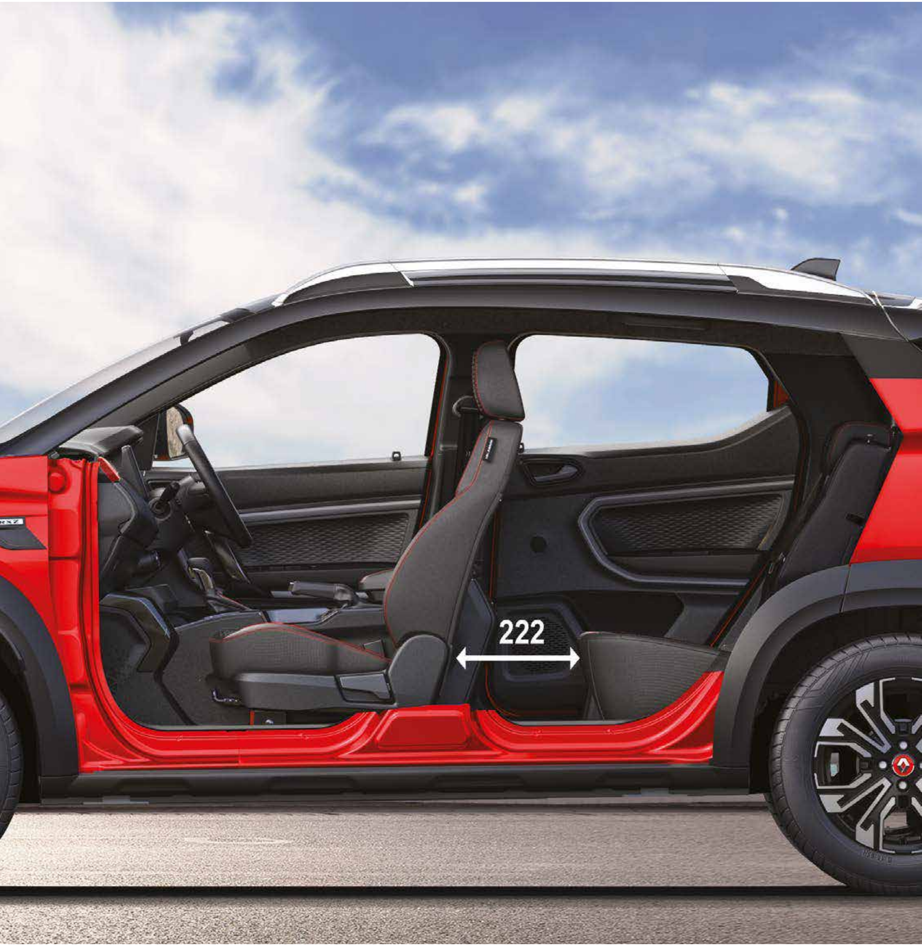
rear knee room of 222 mm

From its premium, modern upholstery to its spacious cabin, everything about Renault Kiger spells comfort. Settle in comfortably and enjoy every drive.