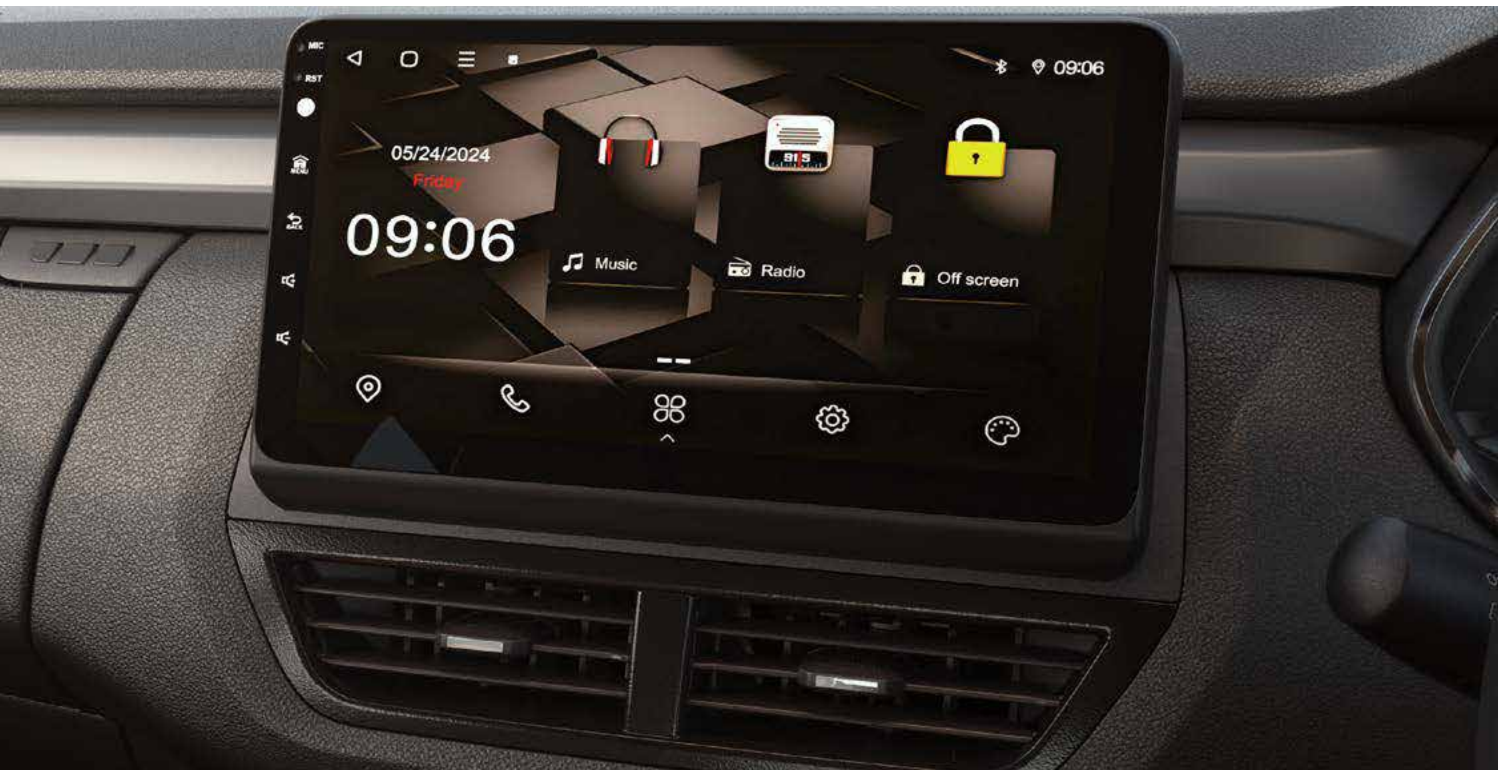
savvy accessory pack The savvy pack includes a 22.86 cm HD touchscreen with wireless smartphone replication and a rear-view camera.