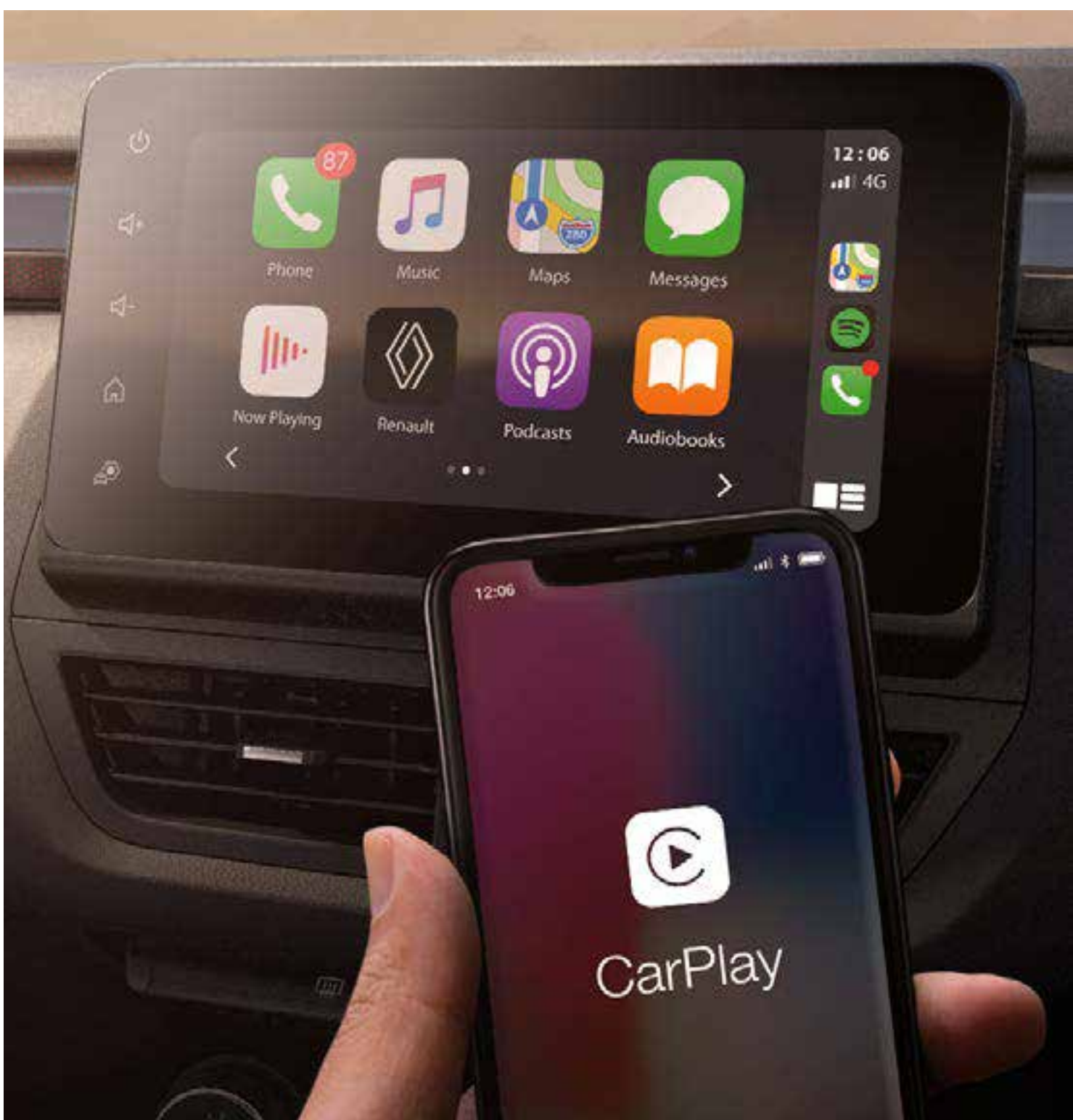
wireless smartphone replication with Android Auto™ and Apple CarPlay™