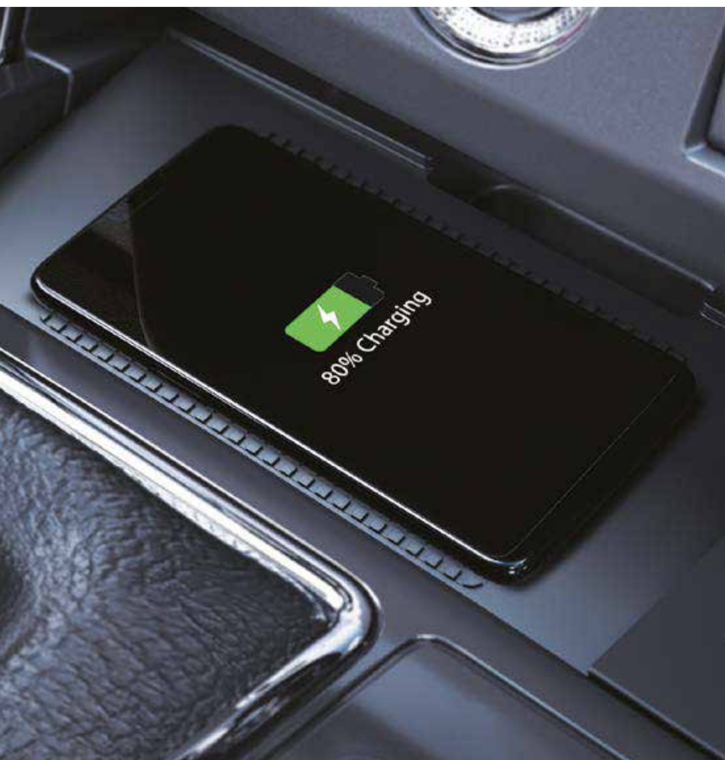
wireless smartphone charger

Begin your journey with a push of the start button. Seamlessly link your smartphone to the 20.32 cm floating touchscreen via wireless replication, all while it charges wirelessly. Elevate your comfort with the take-a-break reminder, which prompts you to pause for refreshing stops on long drives.