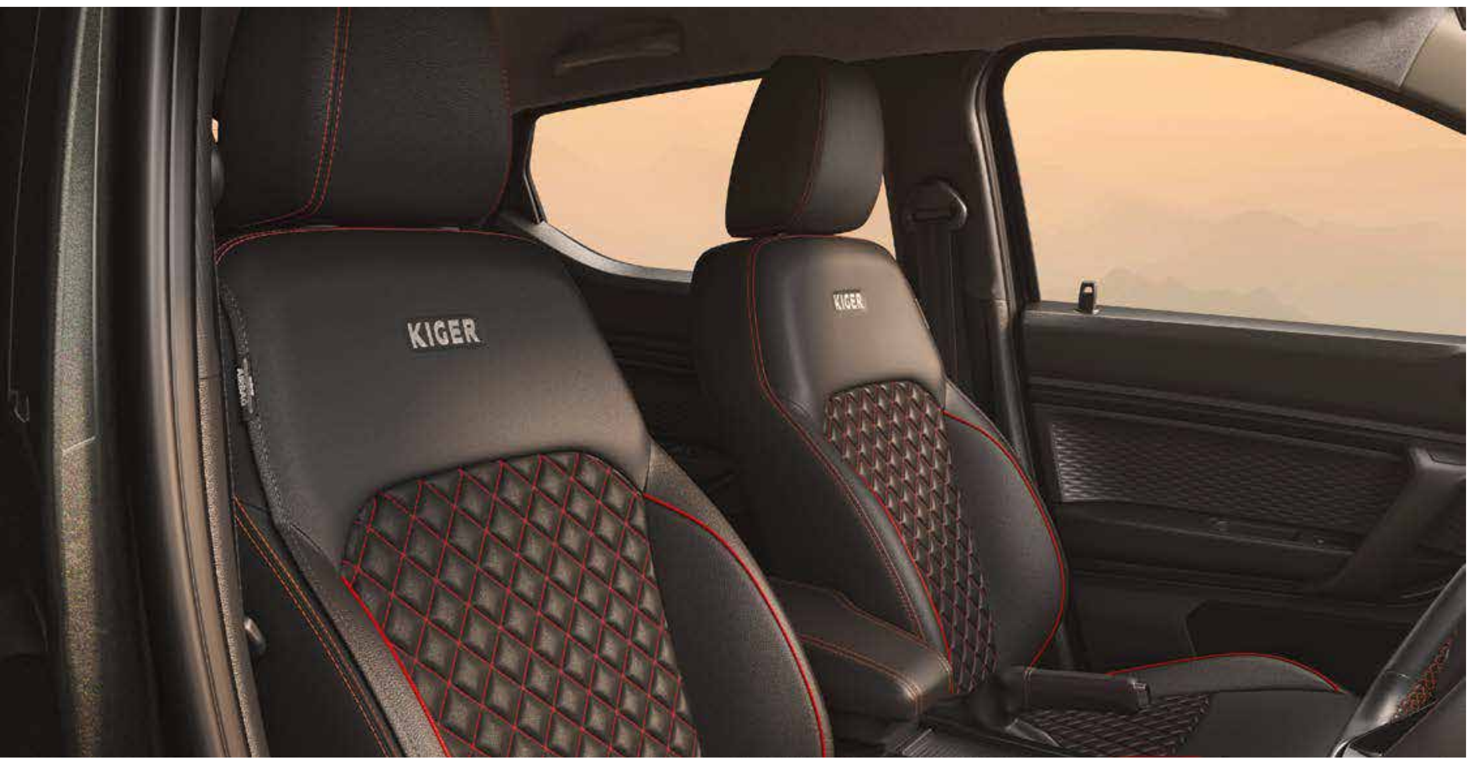
airbag compatible seat covers (with cut-out) The seat covers are crafted to be compatible with airbag deployment for enhanced safety.