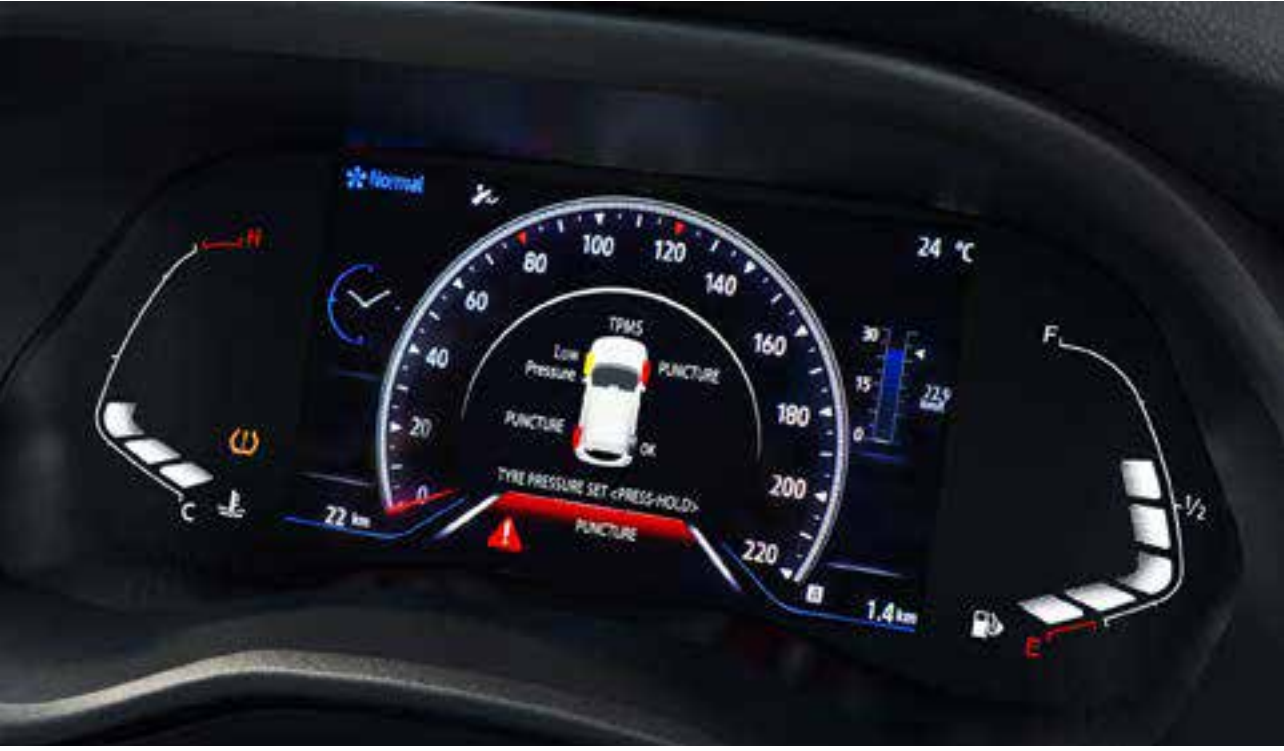
tyre pressure monitoring system Displays the tyre pressure status in real-time.