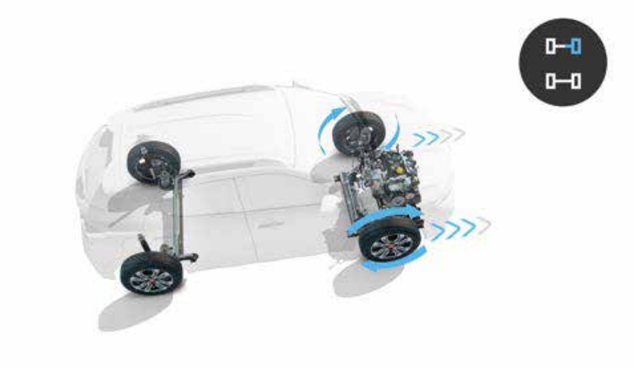
traction control system Limits wheel slip during starting, acceleration and braking.