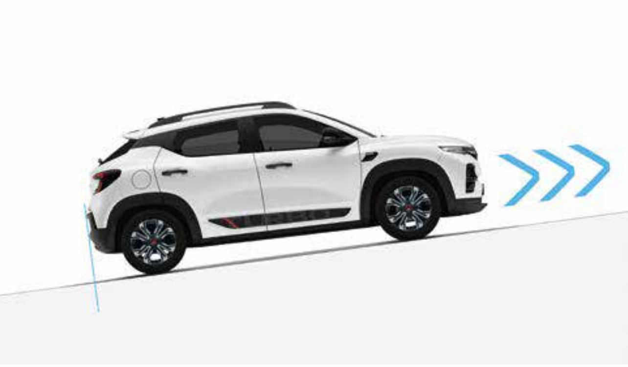
hill start assist Maintains brake pressure for two seconds, preventing rollback when you move away on a steep slope.