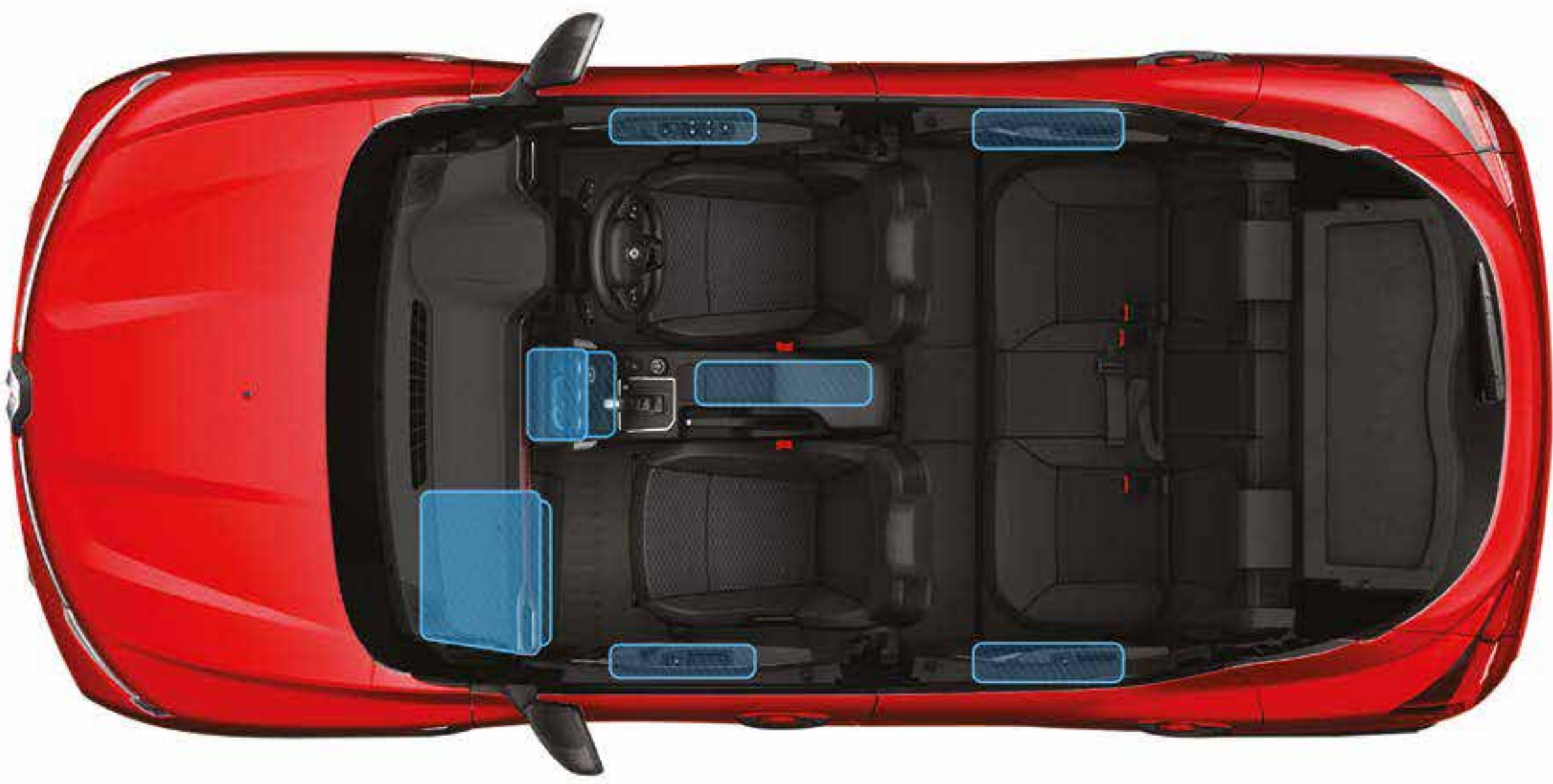
total cabin storage volume of 29-litres

Discover the practical side of Renault Kiger. This SUV comes with a generous 405-litre boot space and ample cabin storage for you to house all your essentials easily.