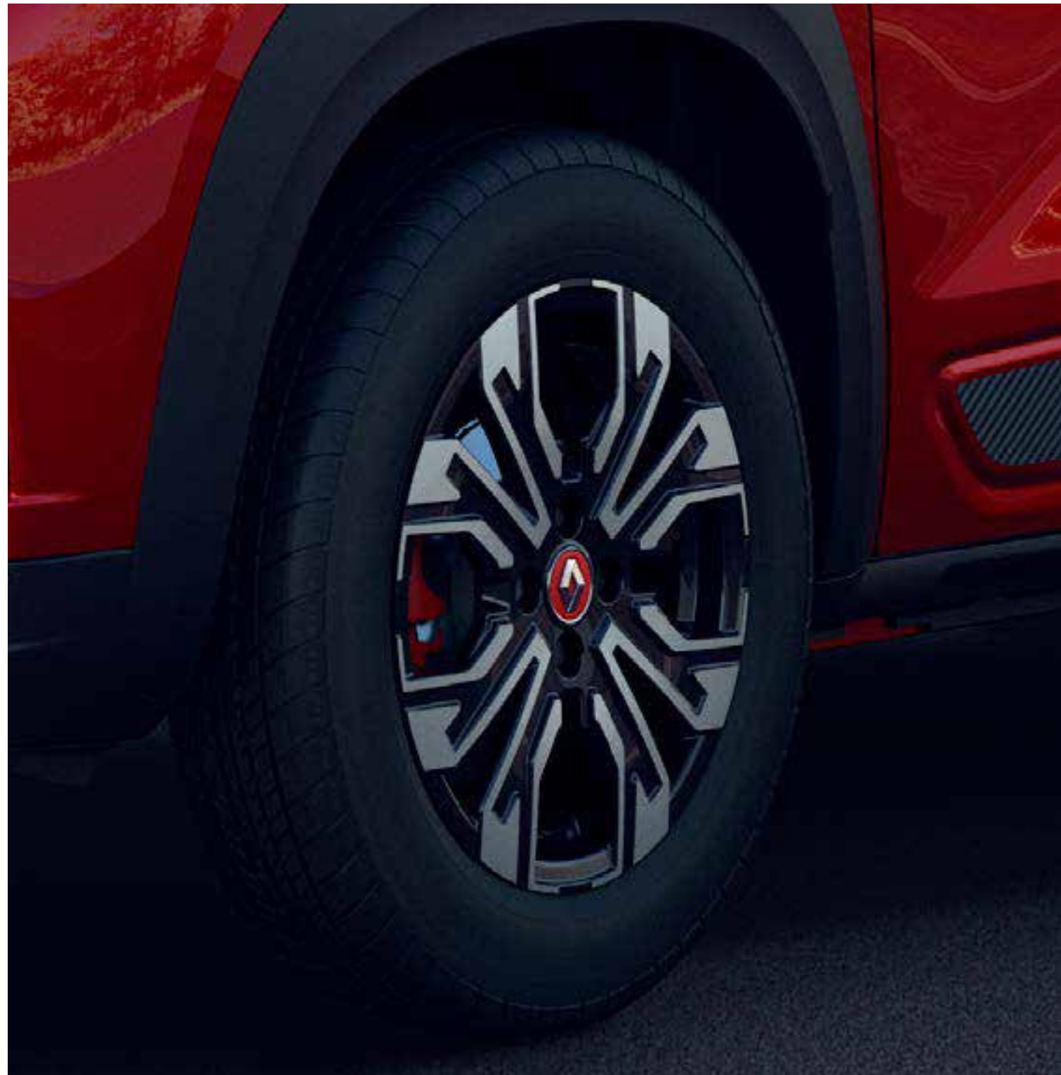
40.64 cm diamond cut alloy wheels