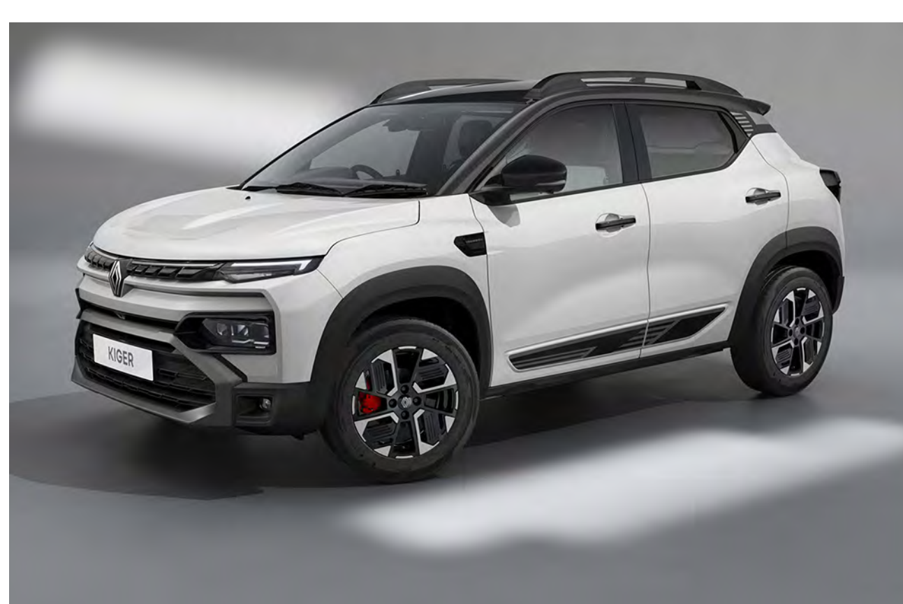
ice cool white with mystery black roof