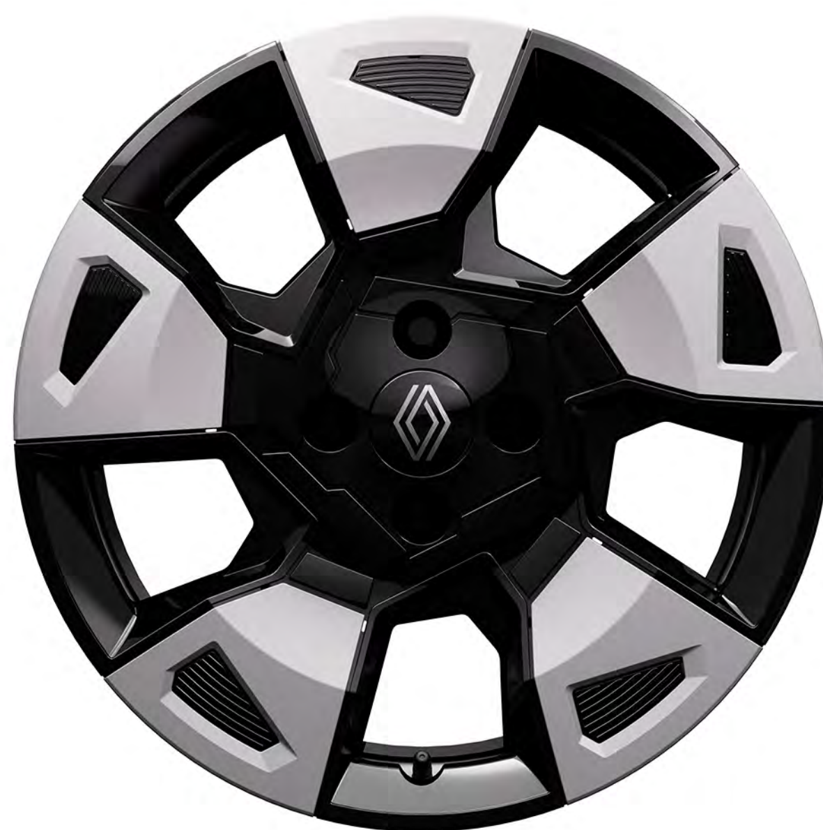
40.64 cm "discover" flex wheels

Android Auto™ is a trademark of Google Inc. Apple CarPlay® is a trademark of Apple Inc.