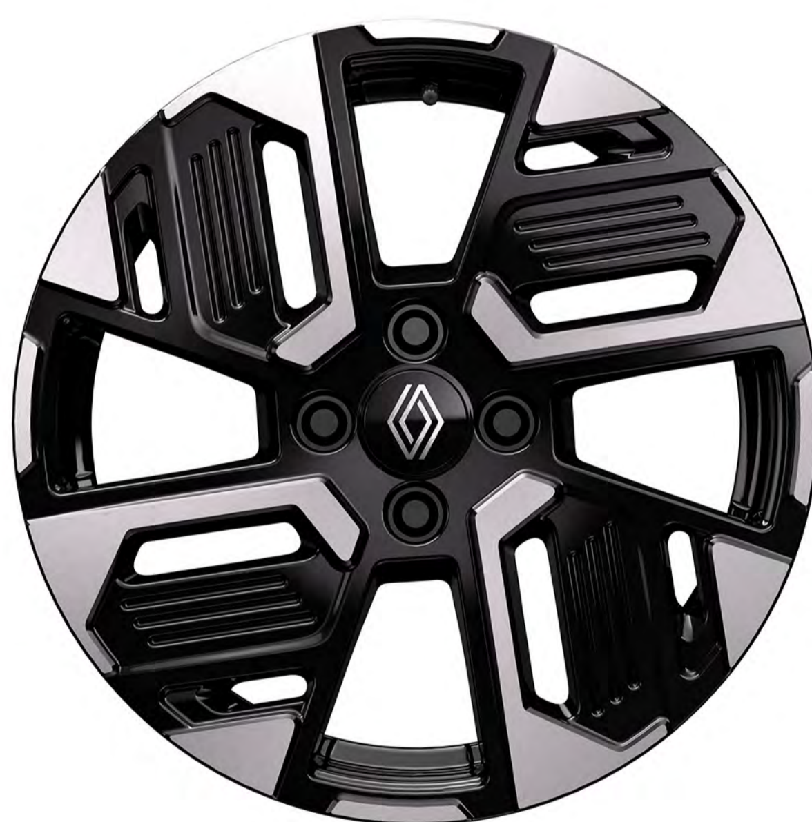
40.64 cm evasion diamond cut alloy wheels