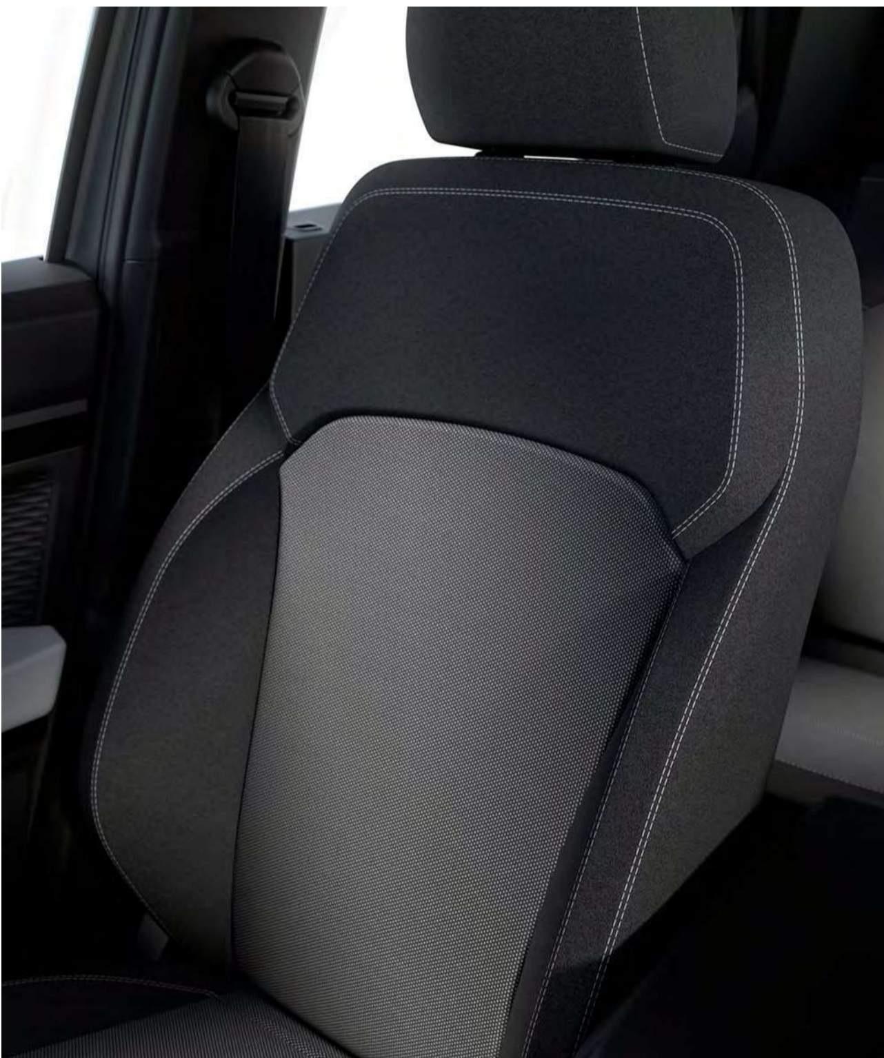
black fabric upholstery