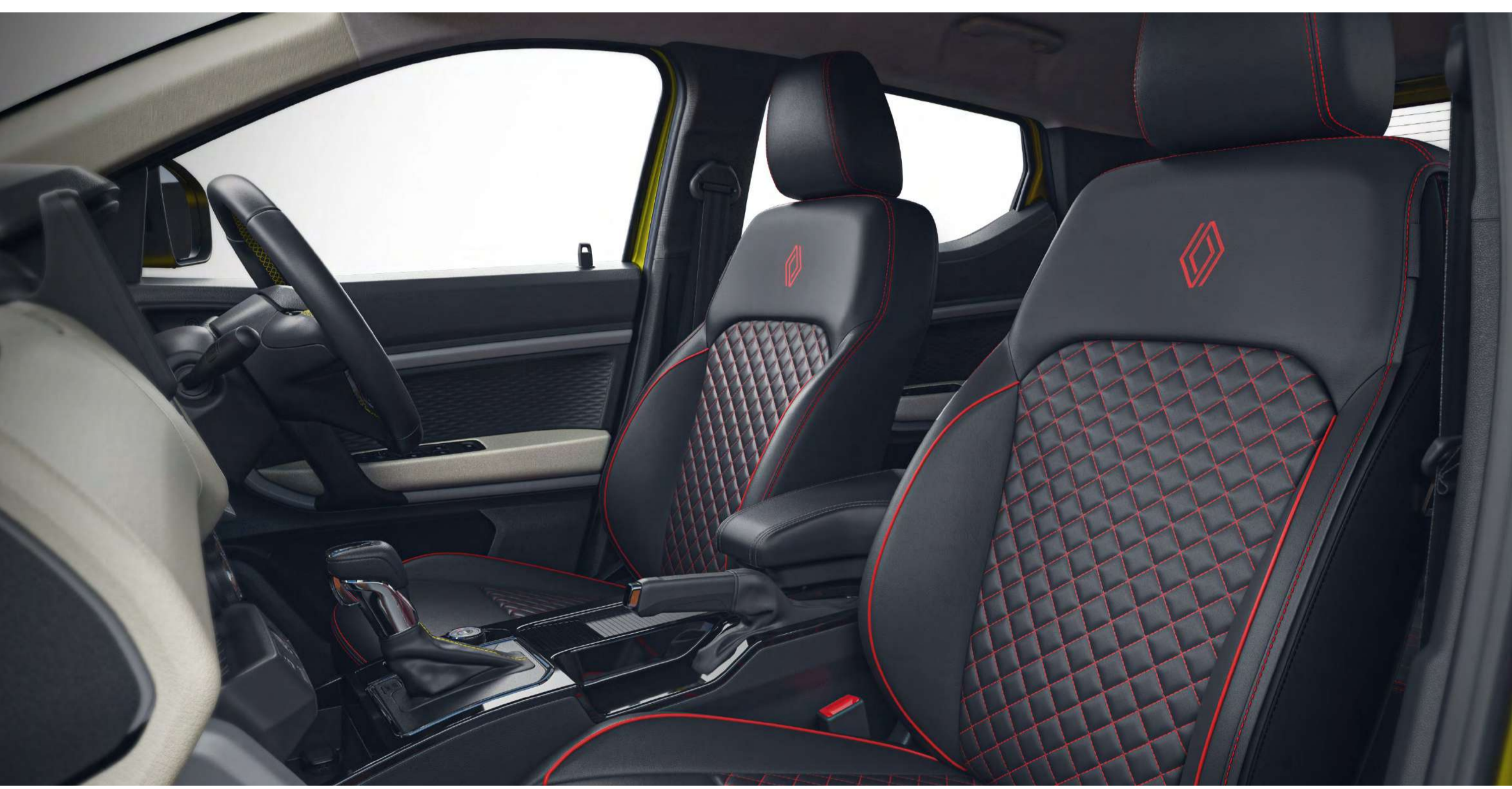
airbag-compatible seat covers A perfect balance of aesthetics and comfort while allowing unhindered airbag deployment.