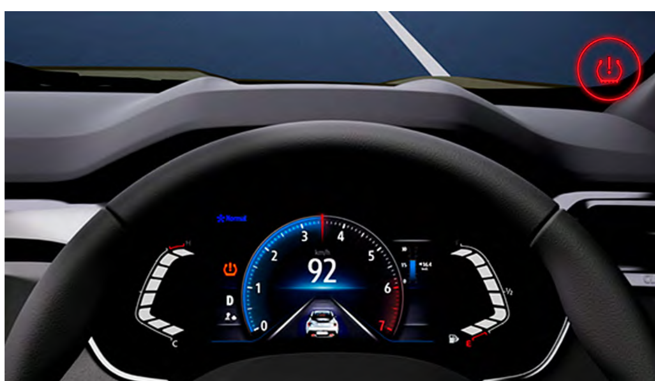
tyre pressure monitoring system Displays the tyre pressure status in real-time.