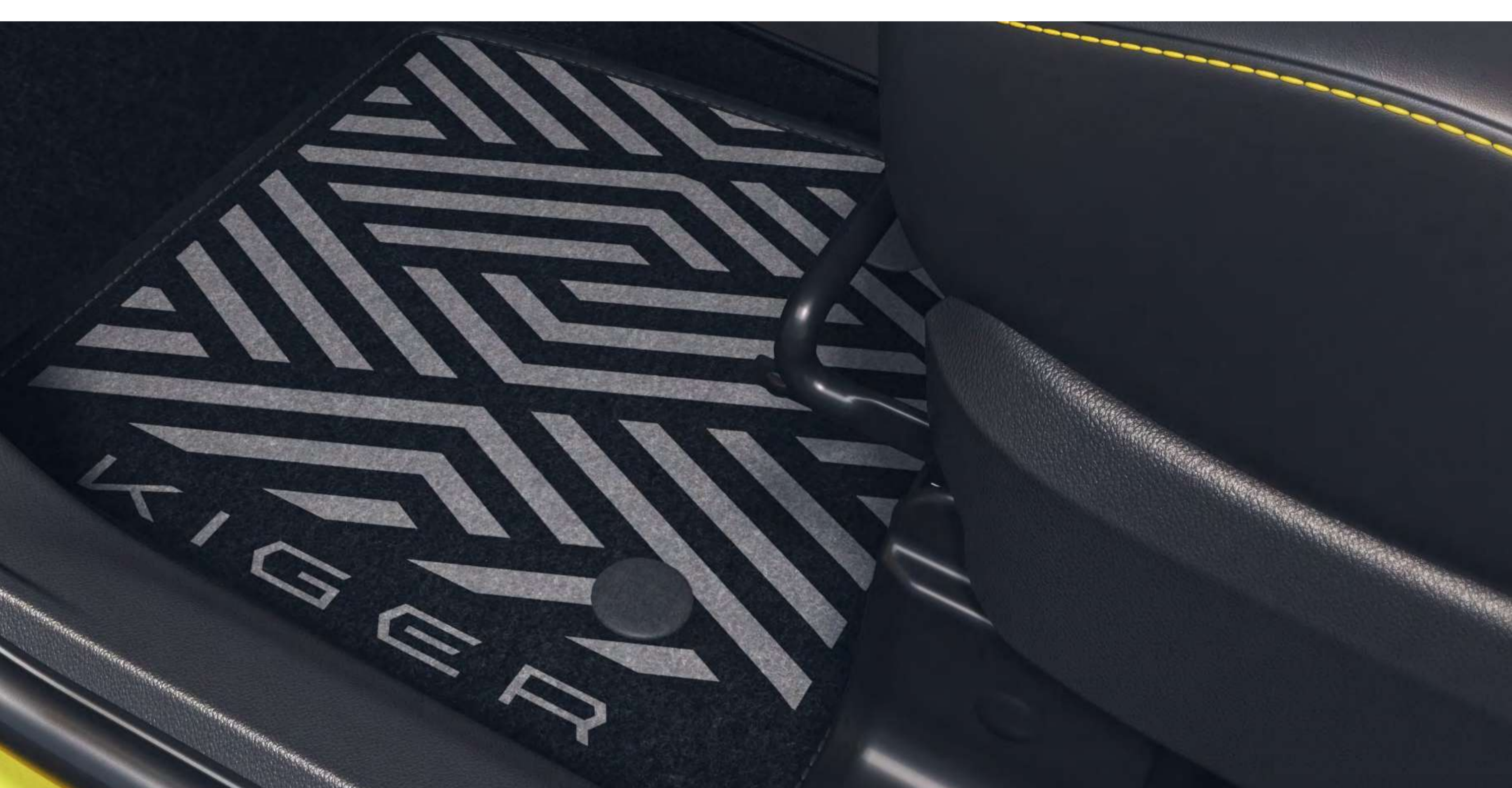
moulded mats Easy-to-clean, durable and snug fit mats that keep your cabin spotless while maintaining a refined look.