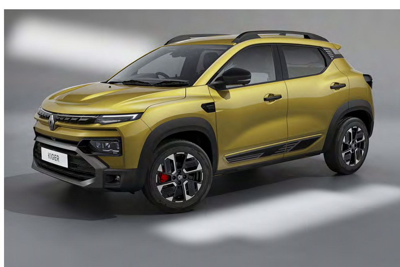
new oasis yellow