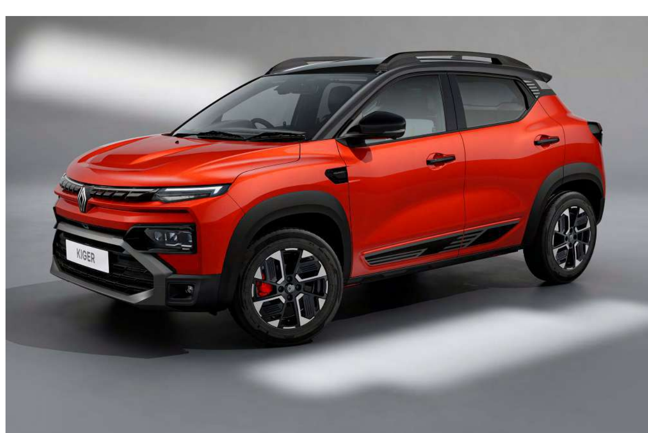
radiant red with mystery black roof