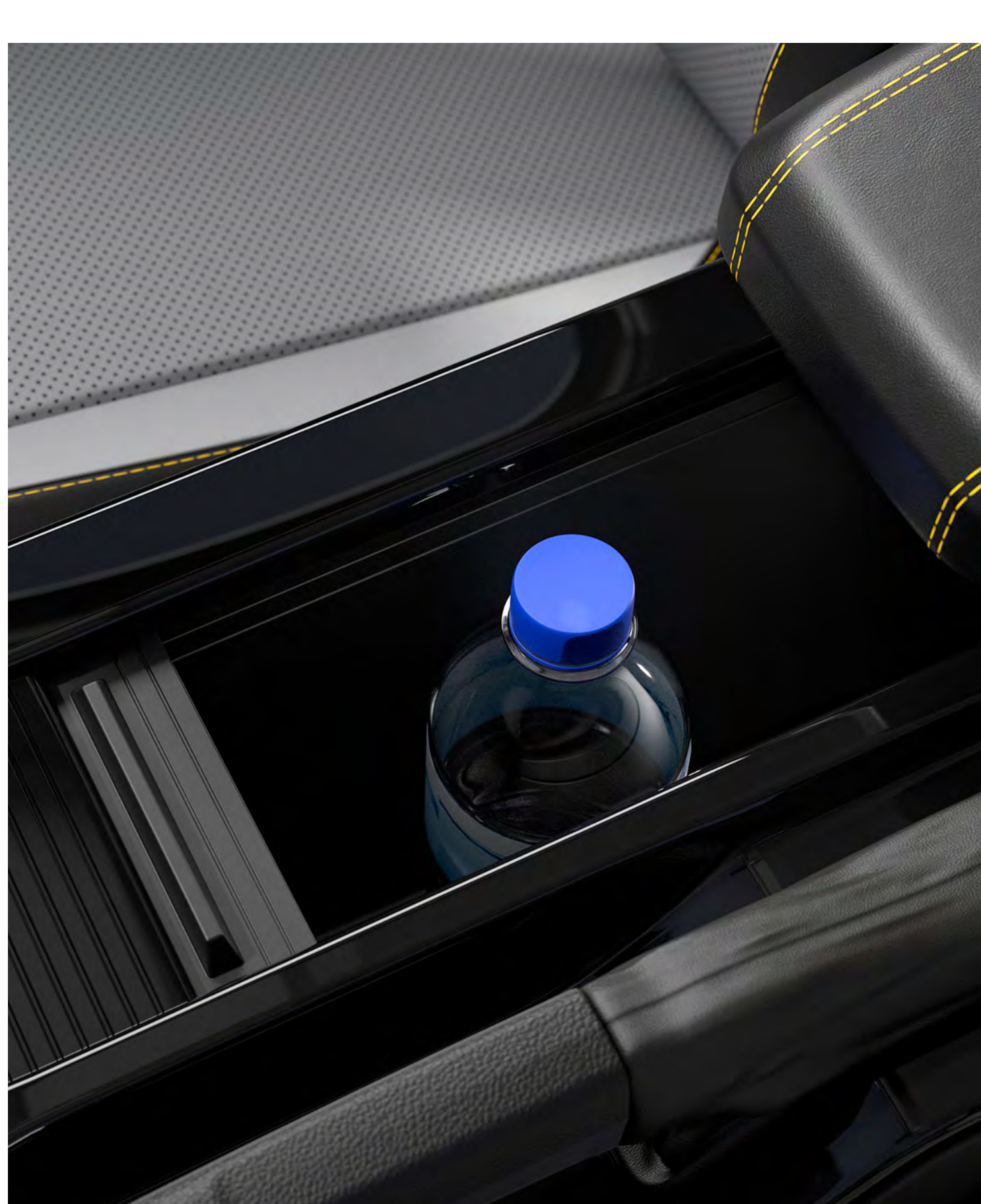
high centre console with storage