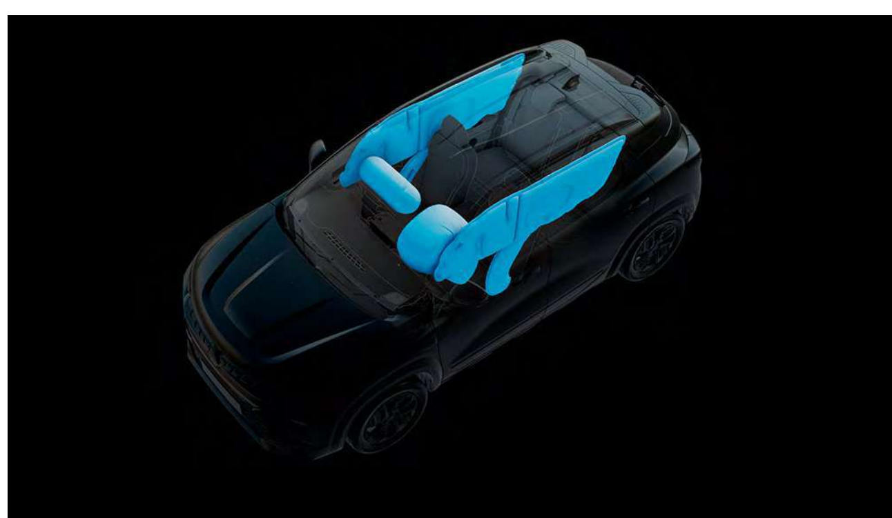
6 airbags Six airbags offer increased protection.