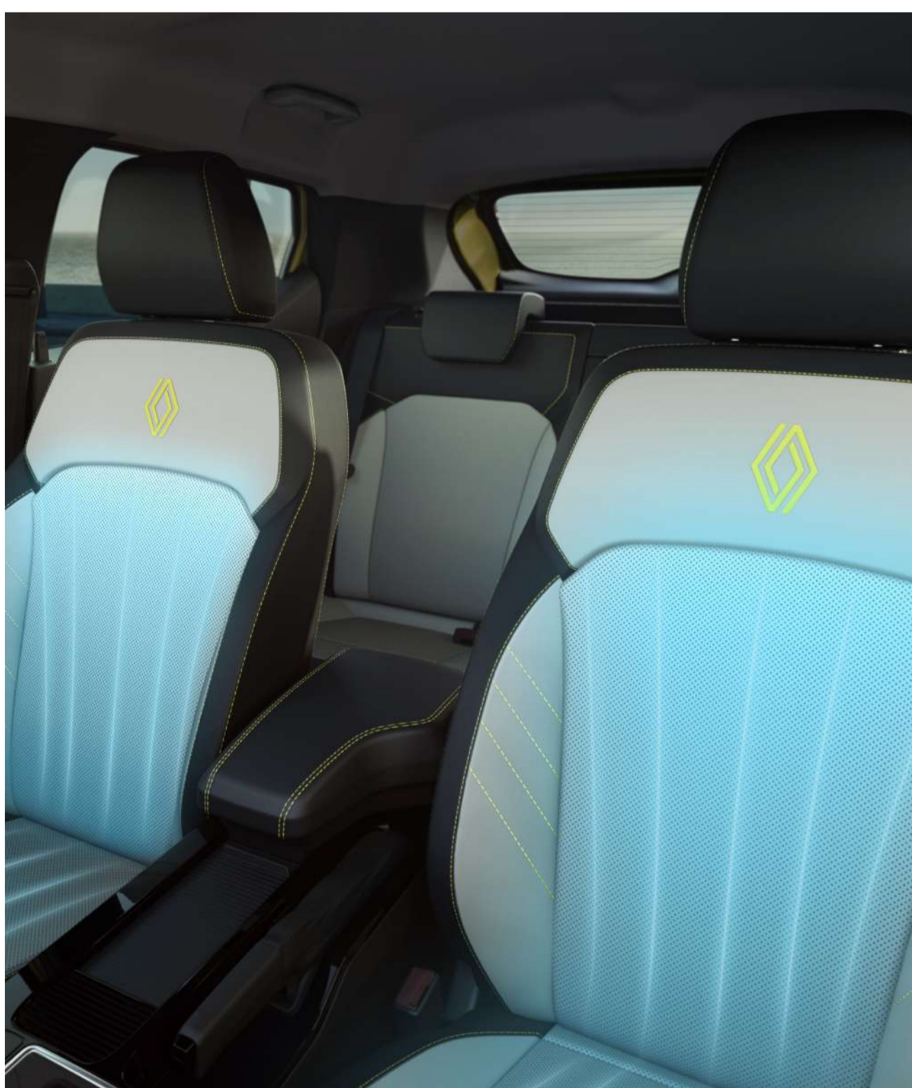
light leatherette upholstery