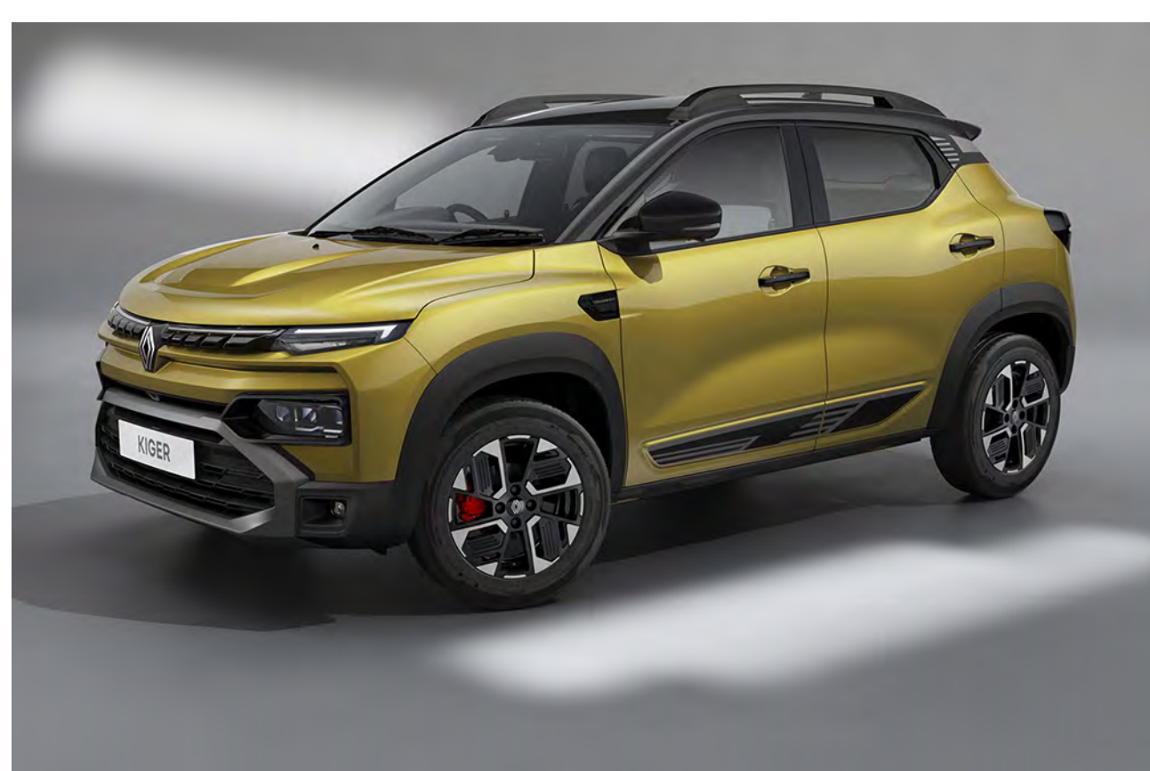
new oasis yellow with mystery black roof