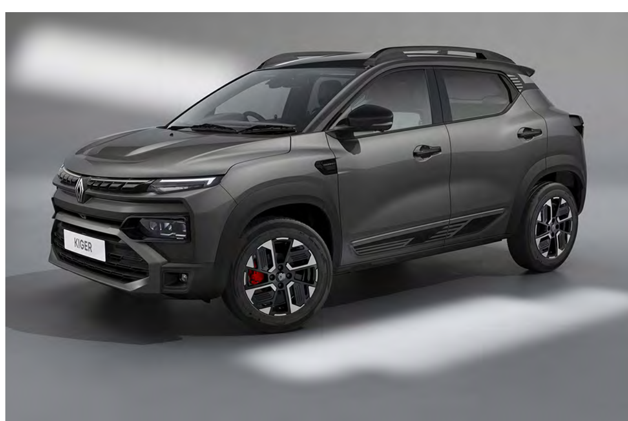
new shadow grey with mystery black roof