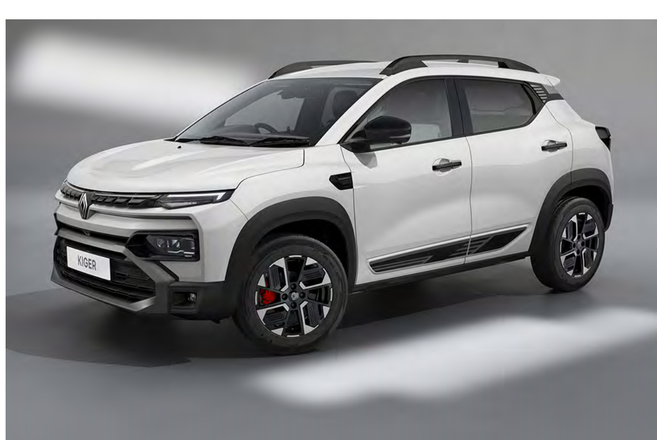
ice cool white