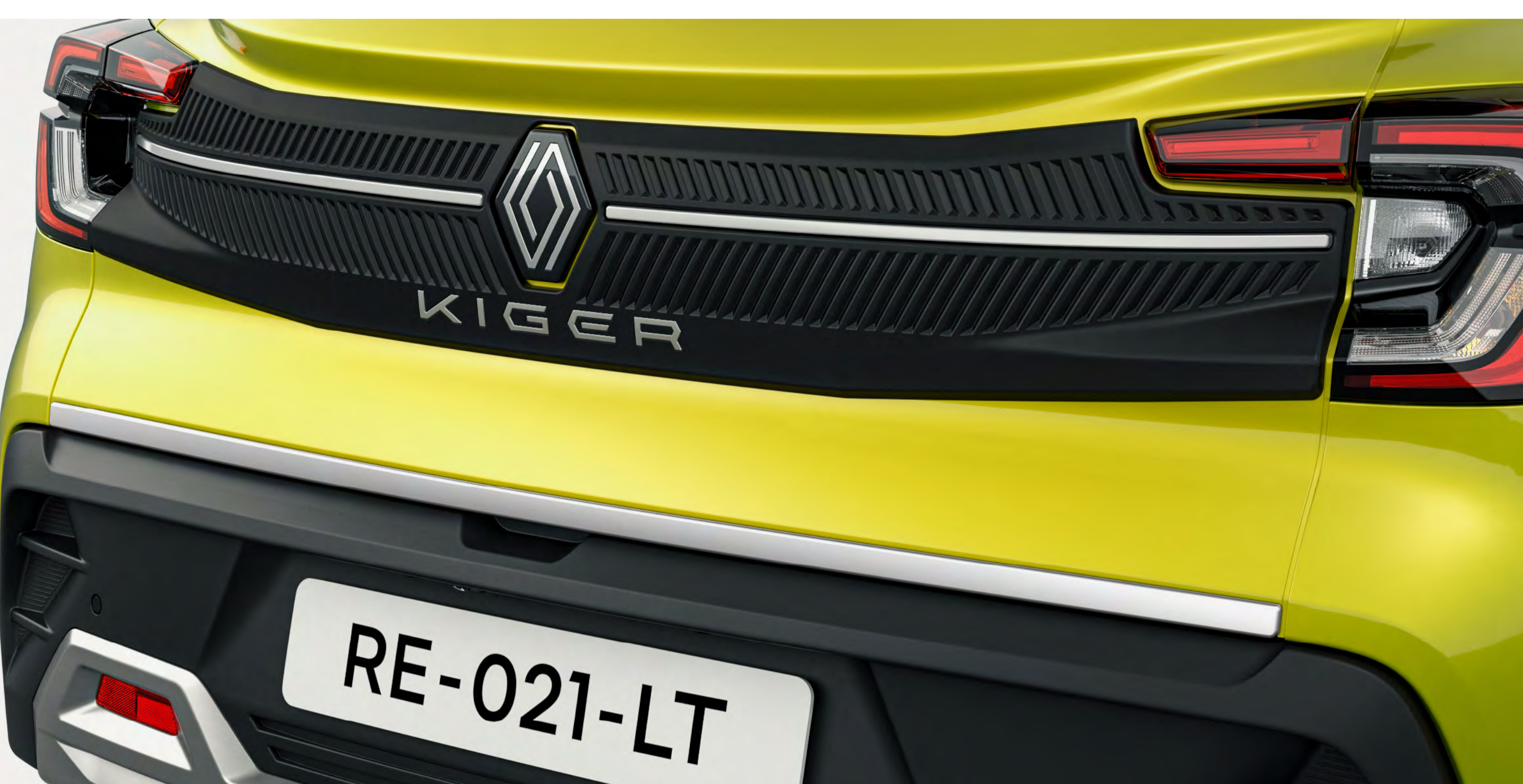
rear trunk cladding Protect the rear from scratches, scuffs, and everyday wear.