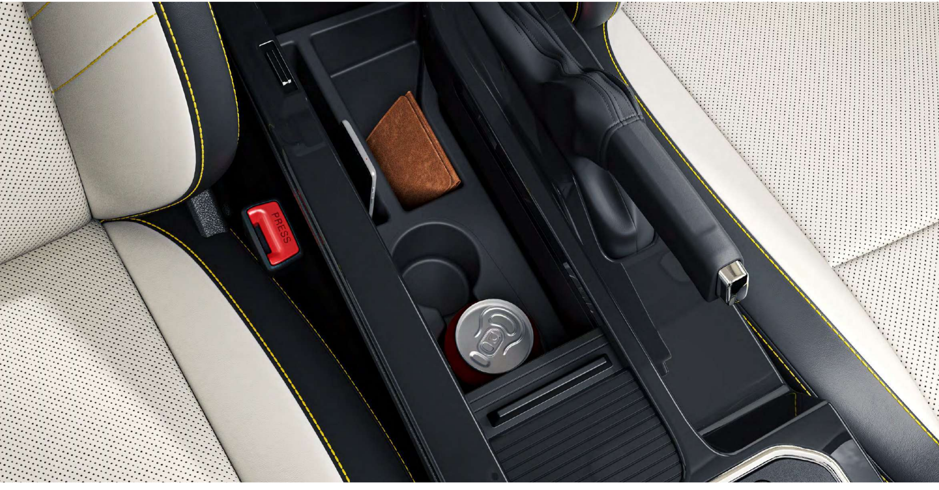
armrest console organiser Neatly store travel essentials for an organised journey.