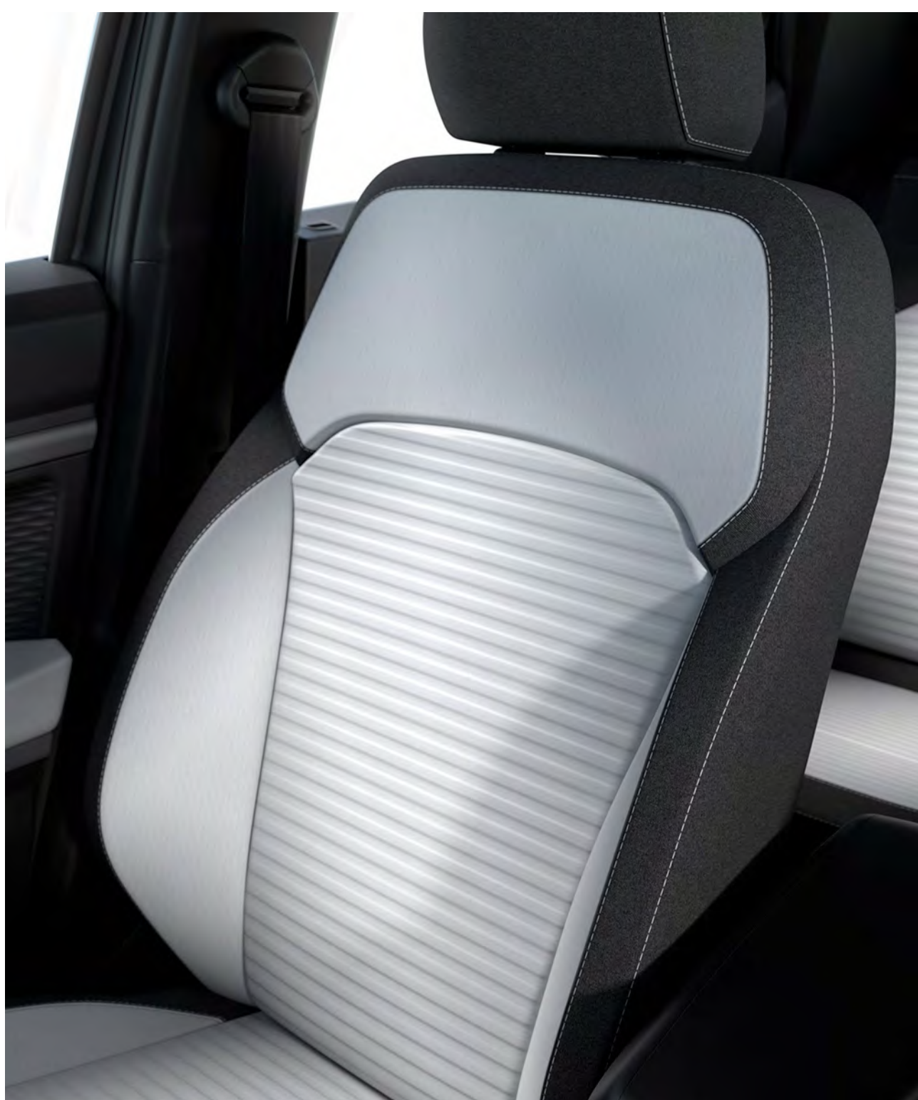
light embossed fabric upholstery