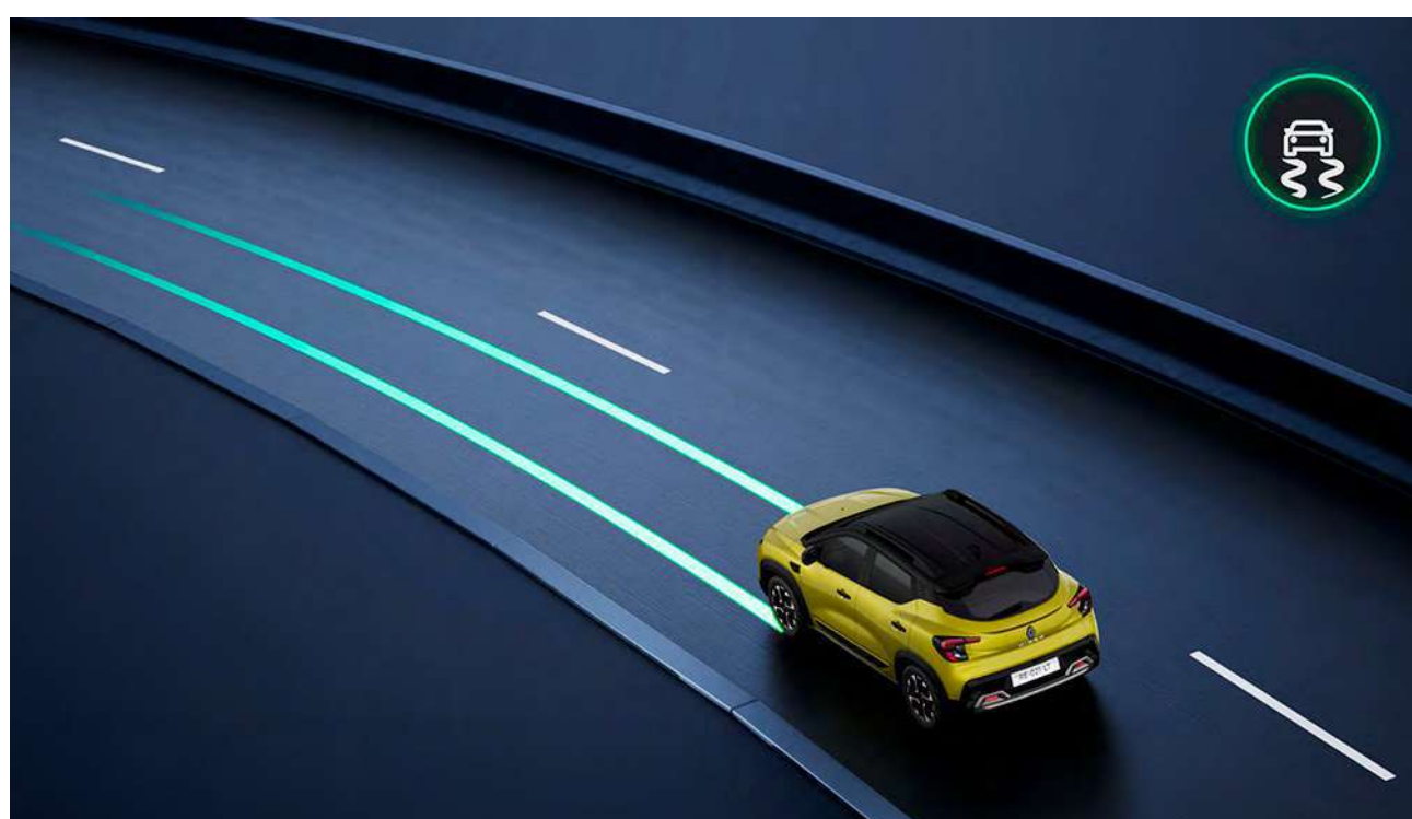
electronic stability program Automatically corrects your car's trajectory so you avoid dangerous skids.