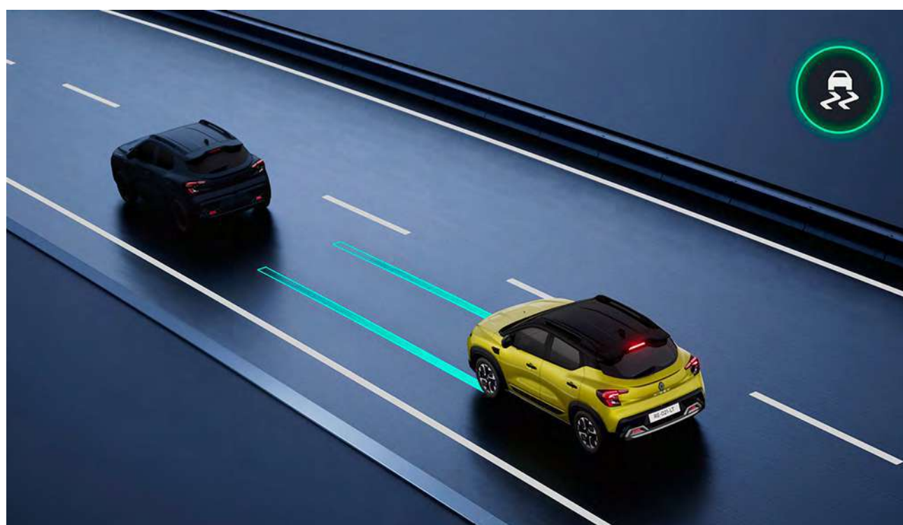
anti-lock braking system (ABS) and EBD with brake assist Optimizes braking force distribution to each wheel, enhancing vehicle stability and control during braking.