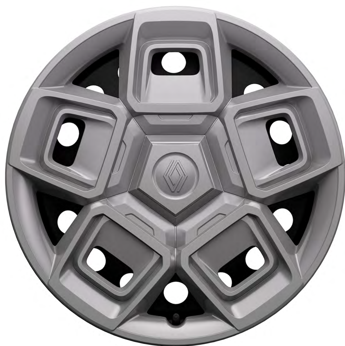
40.64 cm steel wheels with "voyage" wheels covers

Android Auto™ is a trademark of Google Inc. Apple CarPlay® is a trademark of Apple Inc.