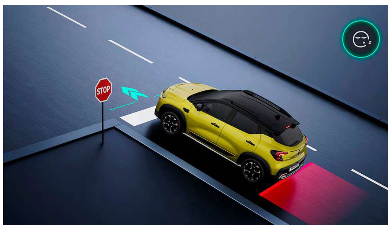
hill start assist Maintains brake pressure for three seconds, preventing rollback when you move away on a steep slope.