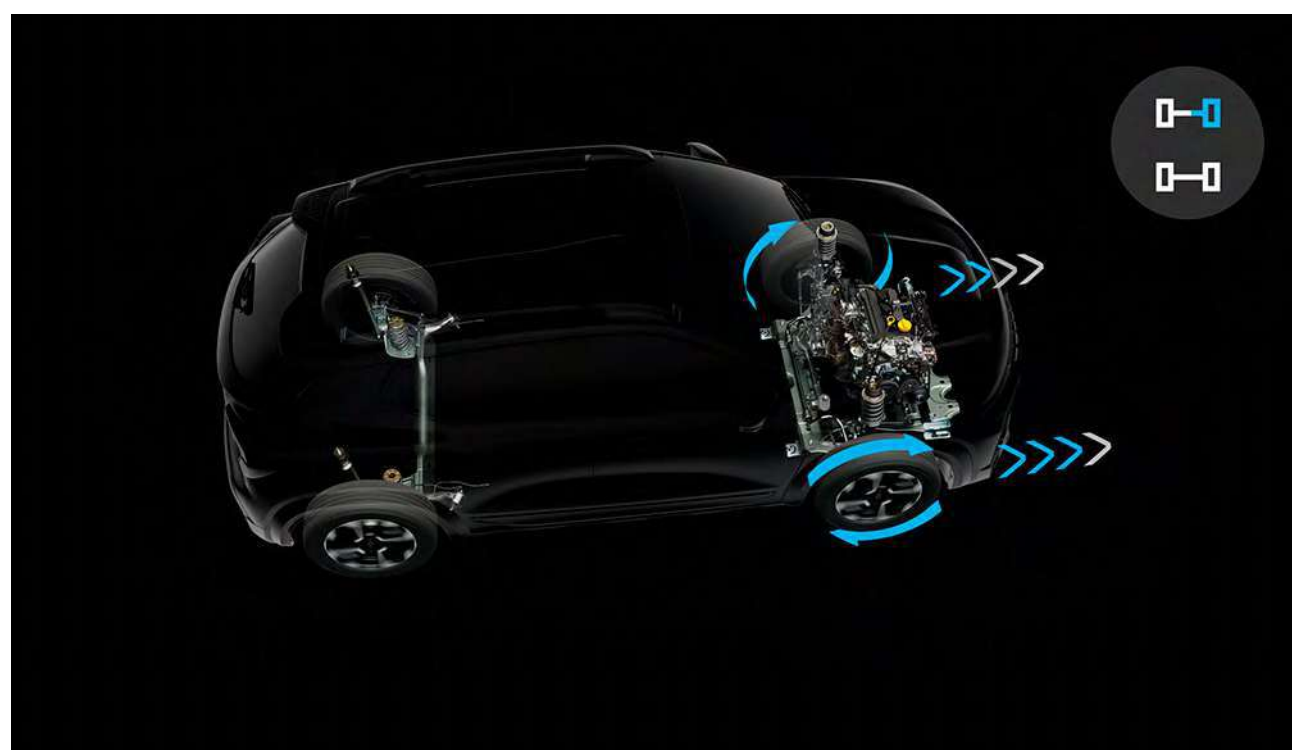
traction control system Limits wheel slip during starting, acceleration and braking.